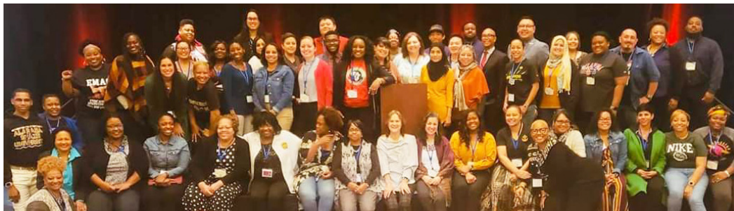
Participants and staff liaisons pose for a group picture at the conclusion of the MLT/WLT training in Orlando, FL.

The project which began last year, includes 68 NEA members who applied and were selected to serve as a peer coach or cohort member. To address the importance of mentorship, project participants were paired with a mentor. Mentors are able to provide guidance on navigating the challenges of leadership, specifically for leaders of color, and assist participants with the creation of individualized leadership development plans. Additionally, peer coaches have an opportunity to deepen and expand their leadership, so that the